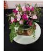
Linda Turner - 8 pts