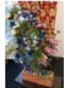
Janet Leeson - 7 pts