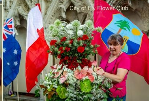
City of Ely Flower Club