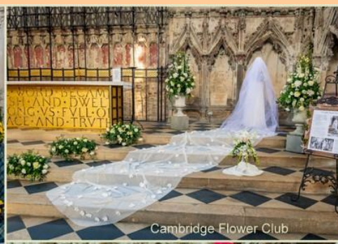
Cambridge Flower Club