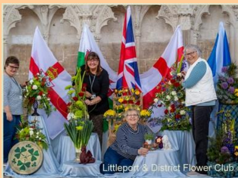
Littleport & District Flower Club

At Ely Cathedral talented local Flower Arrangers were busy creating beautiful floral displays in The Lady Chapel. (titles next page)