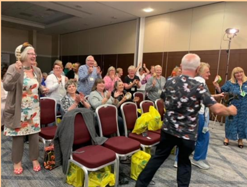
The spontaneous Conga – how many familiar faces can you spot?