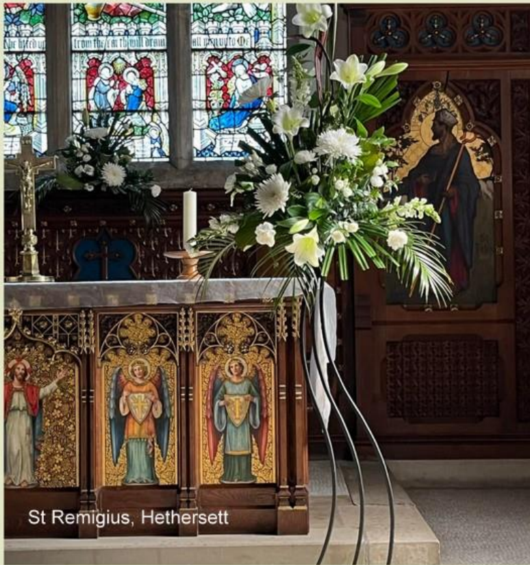
St Remigius, Hethersett