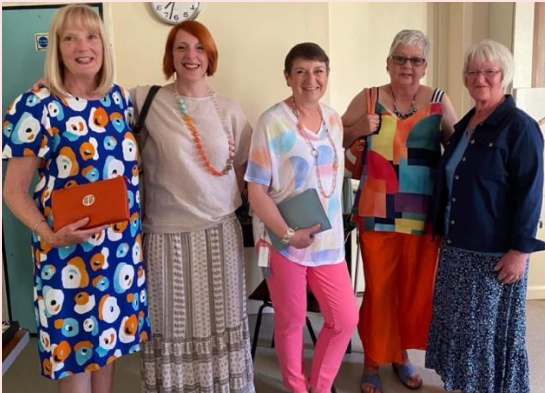
Summer 2022 Fashion at Wickham Market

Soon we were ready to begin. One by one we posed, walked, turned and showed off our garments to our audience. Our Compere for the evening went through each item we were wearing, giving out details of the make, sizing, colours available and cost. The audience showed their appreciation by clapping as we returned to the back room for the next outfit. Thank goodness for all the help we had getting changed. Each new set of items had been laid out ready for us, and the lovely ladies helping us, made sure we had labels tucked in and no glaring combination errors.