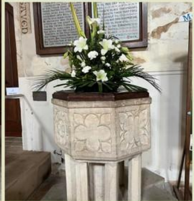
Photos below: Detail of the crown of thorns on the cross at St Edmundsbury. Lilies at Ely Cathedral