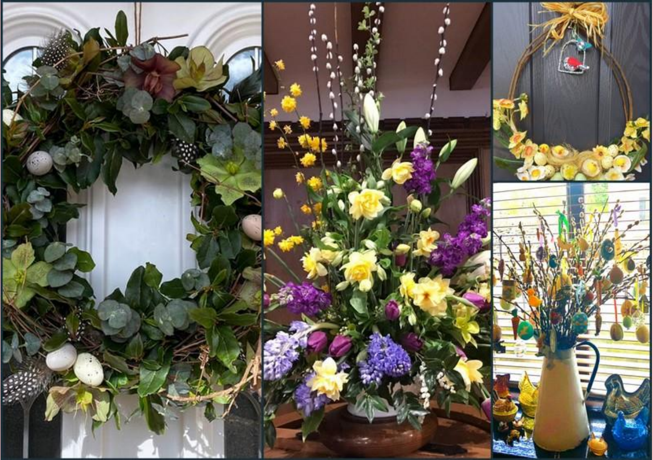
Great Ellingham were very busy too .....using a wide variety of plant material & accessories.