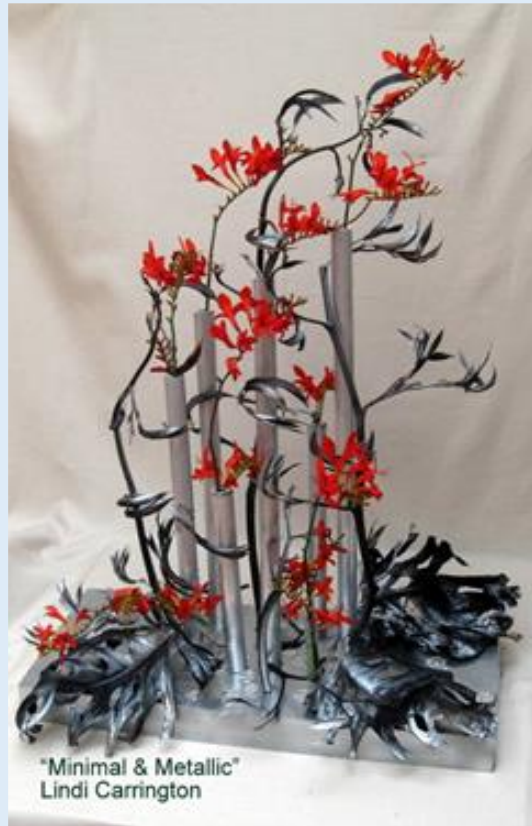
"Minimal & Metallic" Lindi Carrington