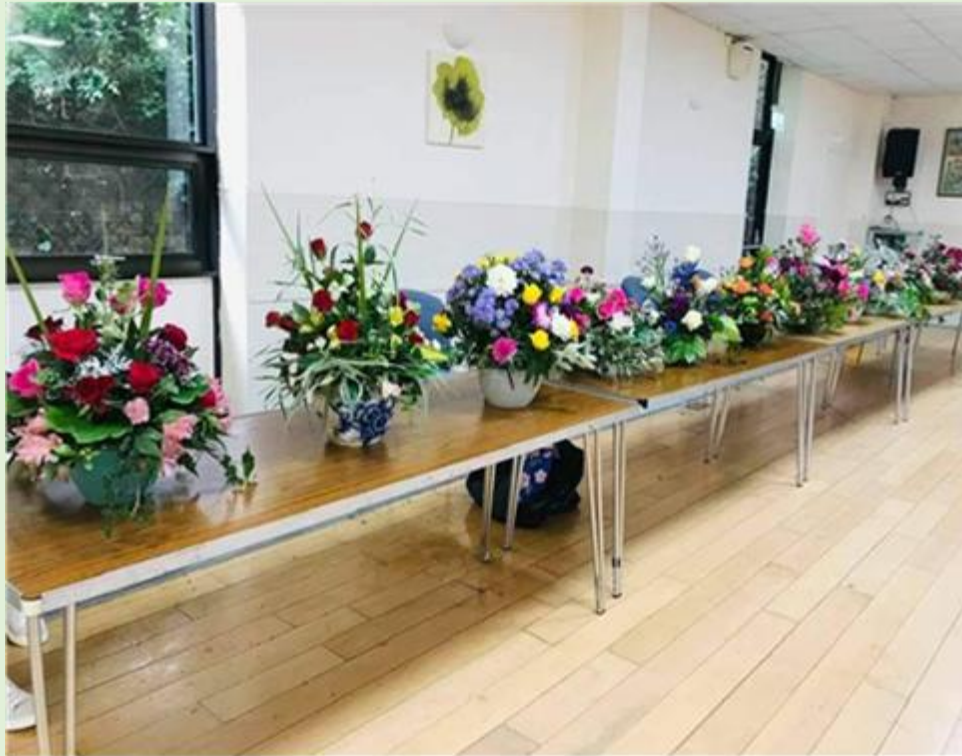
Brampton's September Workshop with Vicki Hease