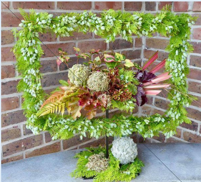
Beverly Moore – "Virid-duo" – an all foliage arrangement