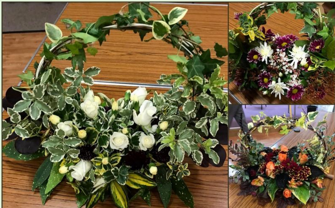
Tiptree's ivy basket workshop