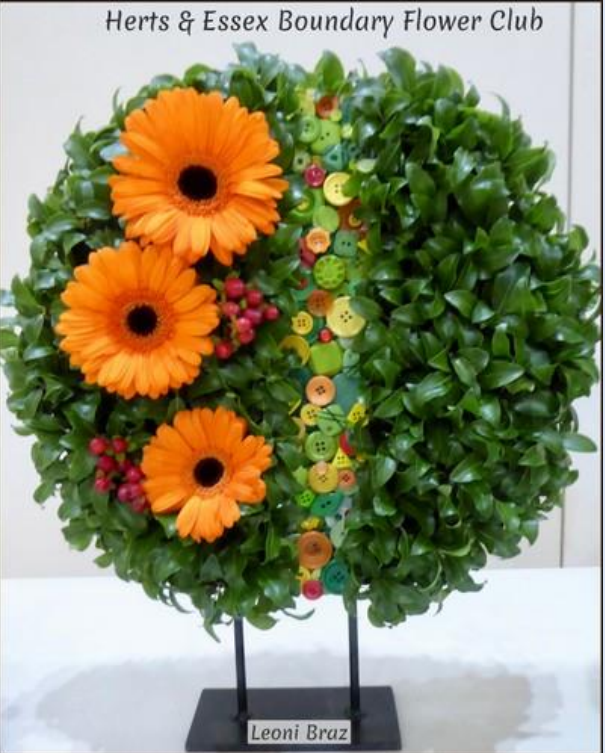
Herts & Essex Boundary Flower Club