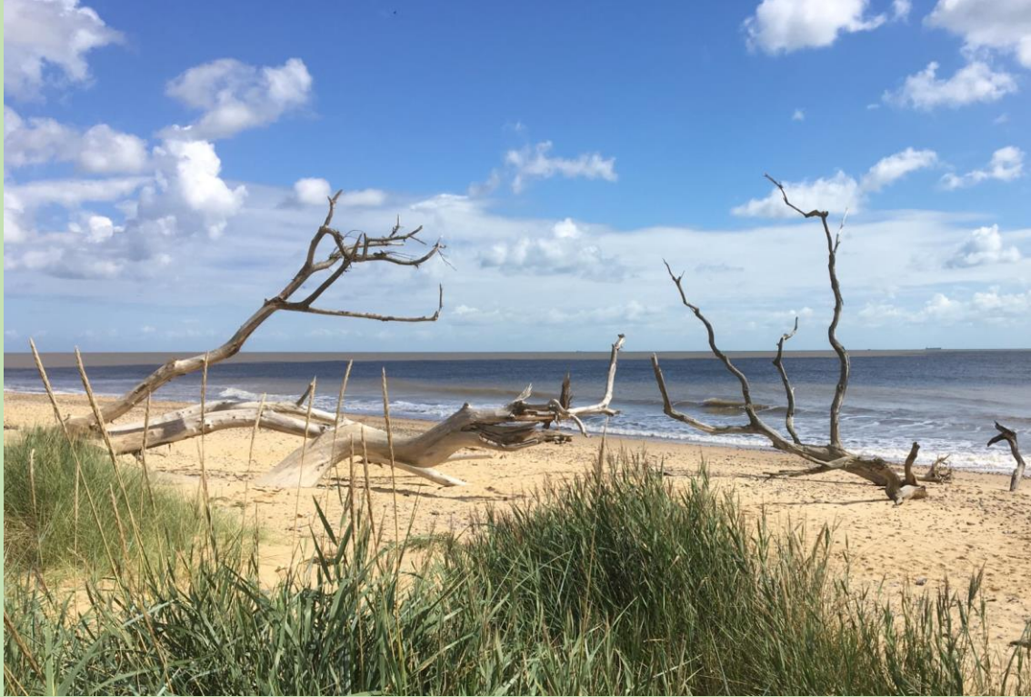
Beverly Moore – Terrific Textures – Commended