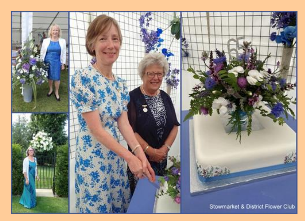
Well done to everyone involved who made our 65th Anniversary such a memorable occasion and even the weather played its part!