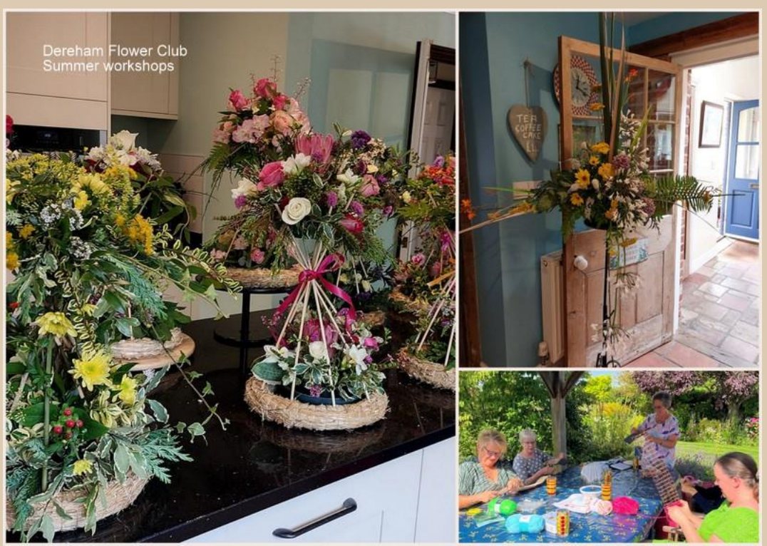
Two tier arrangements, modern pedestal, & designing with plastic bottles