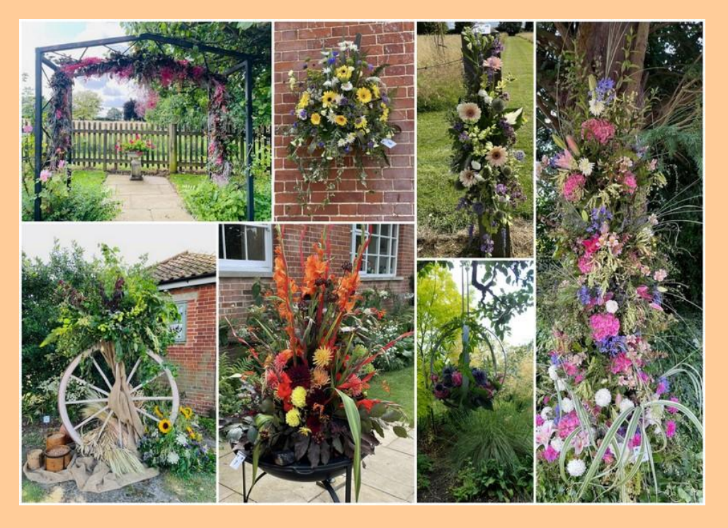
Photo: Some of the many arrangements by the Stowmarket team displayed