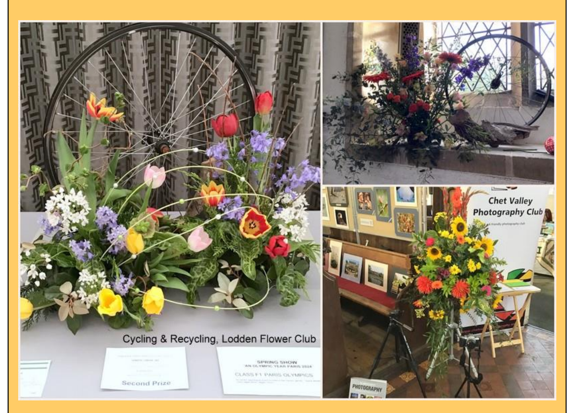
Tricia Loades, Loddon Flower Club

Back to our Flower Festival and Tricia L made a pedestal arrangement for the hobby of Photography. Her husband made a stand out of an old camera tripod. Someone had put this out as the legs no longer extended, but it was just what she wanted!