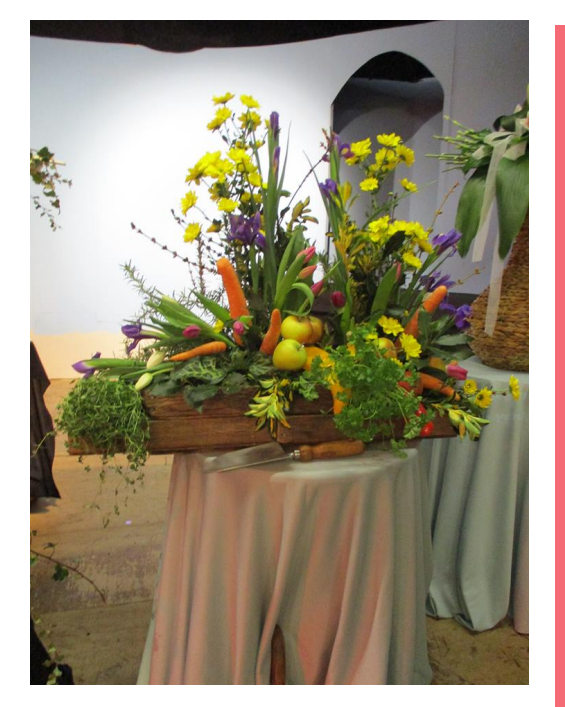
DEMONSTRATION AT BRECKLAND FLOWER CLUB BY VICKI HEASE