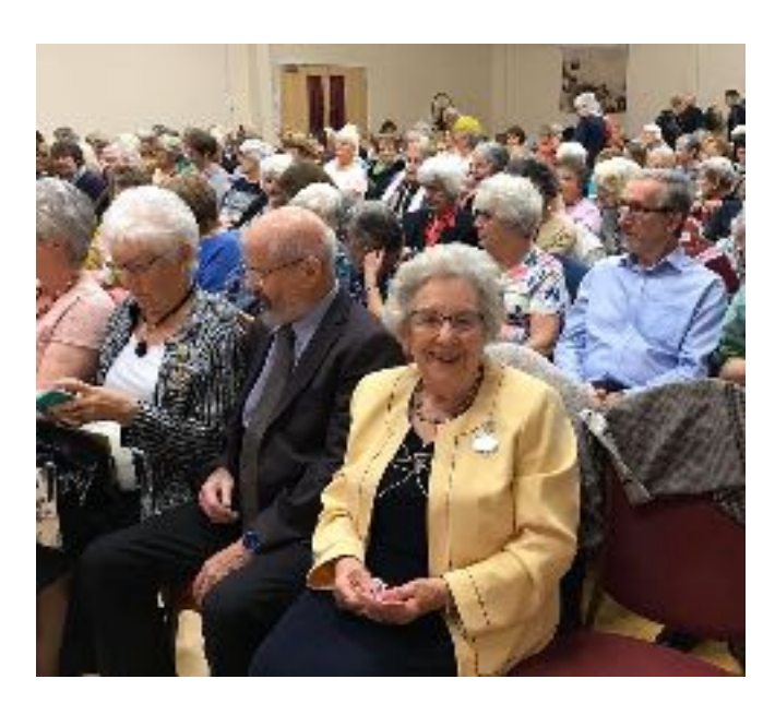
The President's Day was a sell-out and brought much joy and laughter to the many members that attended