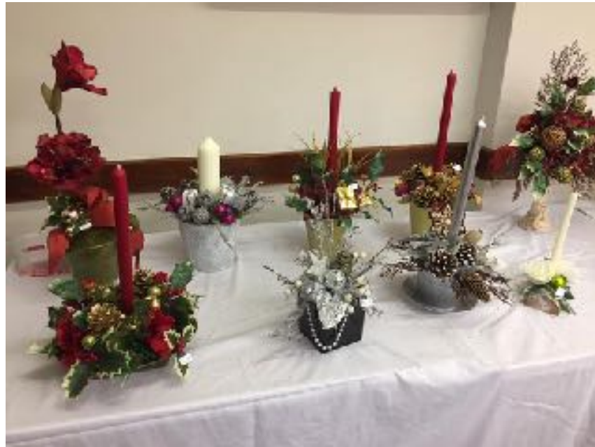
A lovely bit of Christmassy news from Little Hallingbury with a photograph of their stunning festive sales table.

The scene was set for a very Christmassy evening as our ever popular sales table was resplendent with Christmas arrangements, baubles, decorations, beautiful ribbons and goodies of all sorts. A chance to stock up before the main event of the evening our wonderful Christmas demonstration.